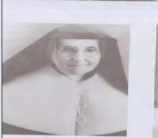
Loreto Sisters of the Institute of the Blessed Virgin Mary have been providing a high quality education in Mauritius for more than one and a half century now.

would not have been liberated in 1835 – and Indian Immigration en masse (450 000 from 1834 to 1923) would not have taken place. As such, Mauritius would not have experienced the evolution of a democratic system of Government." (4)