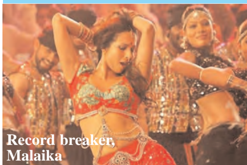
Record breaker, Malaika

A Bollywood song has made it into the record books following a performance Down Under.