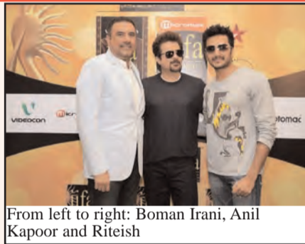
From left to right: Boman Irani, Anil Kapoor and Riteish

4th March, 2011, Mumbai: The International Indian Film Academy (IIFA) Voting Weekend for the IIFA Awards in Toronto, opened recently to the members of the Indian Film fraternity.