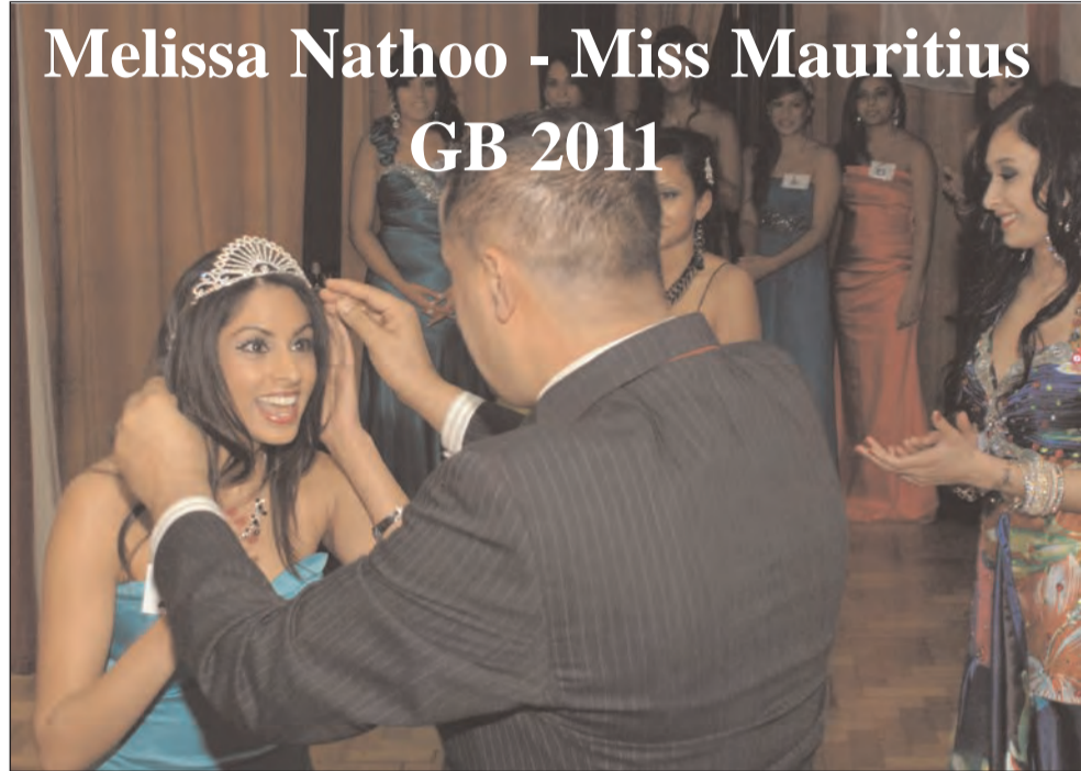
Miss M competition

Feb/March 2011 - No 280 Mouthpiece of the Mauritian Diaspora. Every Overseas Mauritian is an ambassador for Mauritius Monthly - 70p 28th year