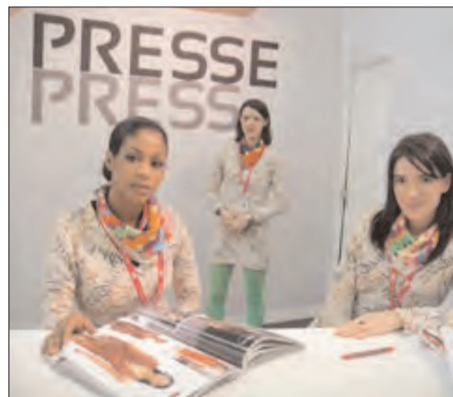
La tenue d'hôtesse de Manish Arora

structural silhouettes, adornment of traditional embroidery, of pearls or extravagant ornaments.