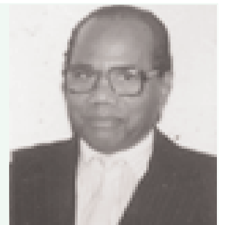
By Marc Grégoire

While the musical group was delivering typical sega sounds of Mauritius paradise, in the right wing in the hall, the barmen were preparing their special drinks and that made my mouth water thinking about