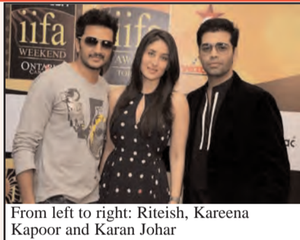
From left to right: Riteish, Kareena Kapoor and Karan Johar