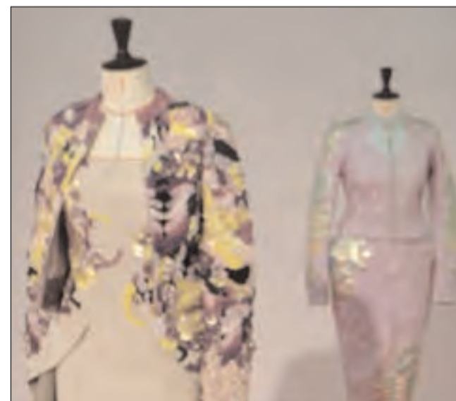
Ensemble mauve et turquoise porté sous un mantel de camaïeu violine