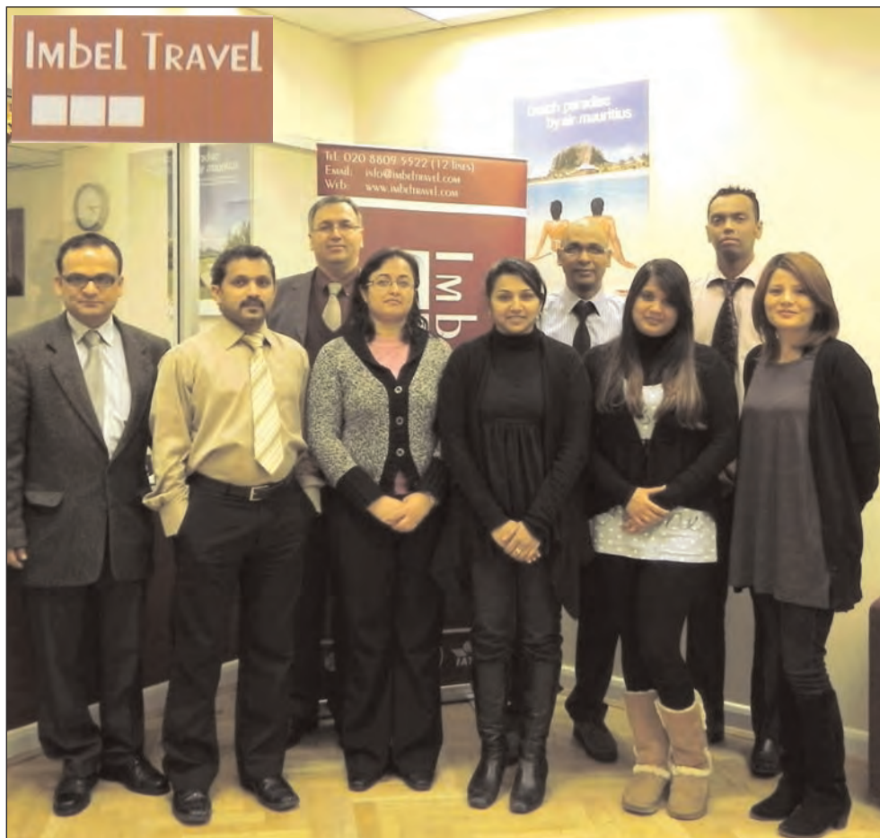
The new team at Imbel Travel is all set to meet the challenge of the trade into the 21st century.