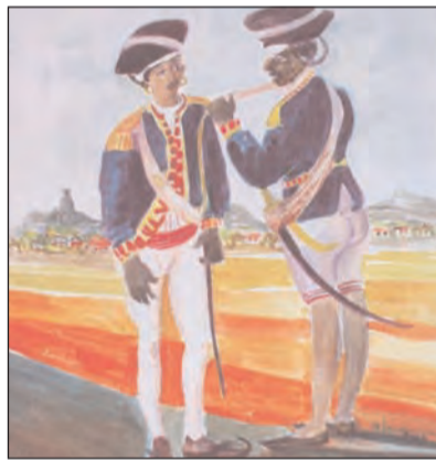
Drawing representing Sepoys in British conquered Mauritius. Only secondary sources mention the participation of Sepoys in the storming of the signal post on Long Mountain on 1 st December 1810. Primary sources such as "Colonel Bayly's Diary" or "A count of the Conquest of Mauritius" are mute on the subject

However, even if primary sources do not seem to warrant an outstanding involvement of the sepoys in storming the flag station, it is undeniable that the latter have magnificently contributed to the success of the 1810