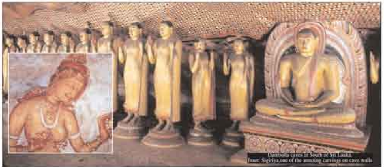
Dambulla caves in South of Sri Lanka. Inset: Szejiya, one of the amazing carvings on cave walls.