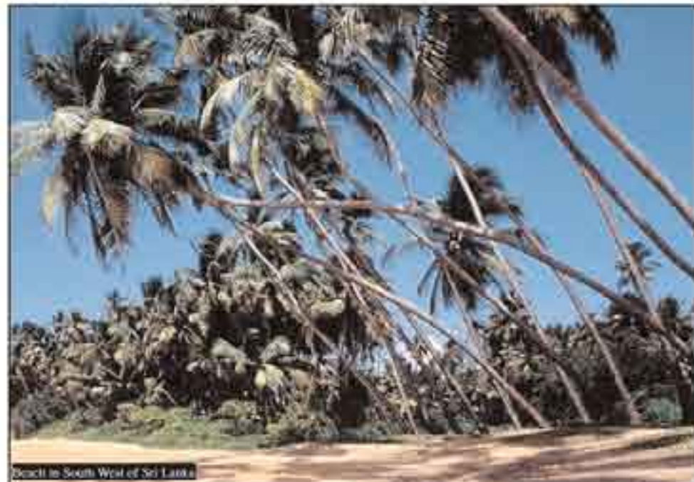
Beach in South West of Sri Lanka