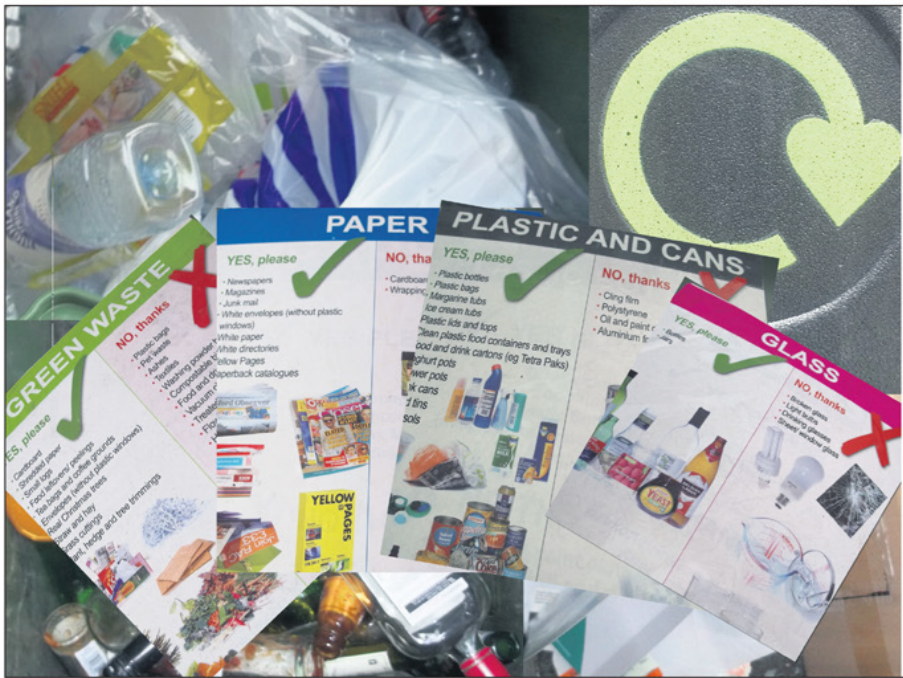
Waste is now classified for recycling

Quand la vieille dame a choisi le sac en plastique pour ses achats, la caissière lui a reproché de ne pas se mettre à « l'écologie ».