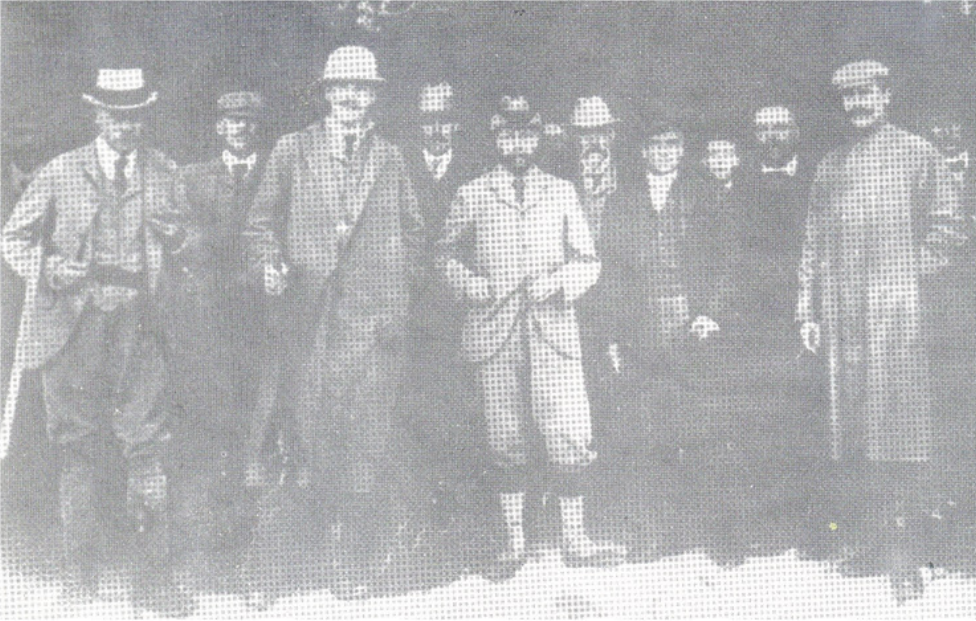
His Royal Highness the Duke of York and Cornwall (3 rd front row, from the left) at Mare-aux-Vacoas during the hunting party organized at Plaine Raoul, Mare-aux-Vacoas, on 7 th August 1901.

The first important event in Mauritius at the dawn of the twentieth century was the visit in August 1901 of the Duke and the Duchess of Cornwall and York, George Frederick Ernest Albert and Victoria Mary, grandchildren of Queen Victoria. (1) Earlier in 1901 the aged Queen had died, her son succeeding as Edward VII. The 1901 royal visitors "were destined to be King George V and Queen Mary." (2)