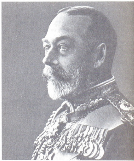
The Duke of York and Cornwall acceded to the throne on June 22, 1911, as George V of England

People swarmed to the capital on the morning of the 5 th of August. "Dès le matin une animation extraordinaire régnait dans la capitale. Une foule énorme, qui grossissait à l'arrivée de chaque train, circulait dans les rues, envahissait les balcons, les fenêtres, les trottoirs et s'écrasait