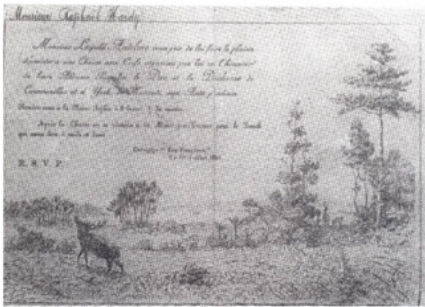
The invitation card dated 1 st July 1901 to the hunting party organized in honour of the Duke and the Duchess.

People swarmed to the capital on the morning of the 5 th of August. "Dès le matin une animation extraordinaire régnait dans la capitale. Une foule énorme, qui grossissait à l'arrivée de chaque train, circulait dans les rues, envahissait les balcons, les fenêtres, les trottoirs et s'écrasait