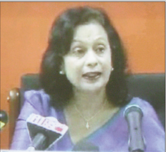
Health Minister, Mrs Maya Hanoomanjee arrested on Corruption Charges