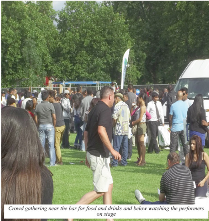
Crowd gathering near the bar for food and drinks and below watching the performers on stage