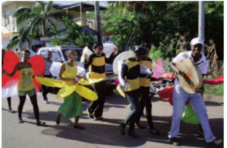
photos from the Environment Day Carnival at Rivière Coco, Rodrigues, Mauritius, 5 June 2011. An authentic Rodriguan-Mauritian carnival - not a single imported Disney character or samba dancer in sight!