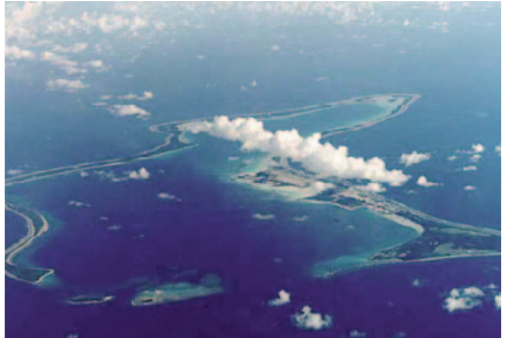
The Cagos Archipelago