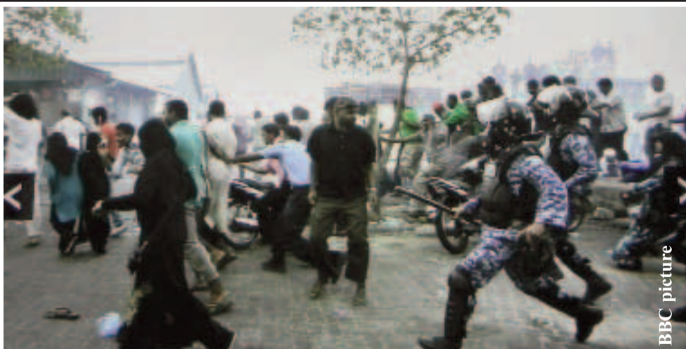
Violent clashes took place in February in the Maldives between supporters of former President Mohamed Nasheed - who said that he was forced to resign at gunpoint and baton-wielding police.

Commonwealth Secretary-General, Mr Kailesh Sharma, stated earlier this month "Parliament is the heart of a democracy. The Commonwealth finds it unacceptable that the State Opening of the Majlis of Maldives has been disrupted, and the offices of the President and Speaker have been seriously disrespected.